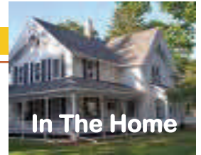
In The Home

A few eco-friendly tips for cleaning up around the home with non-toxic cleaners you can make yourself